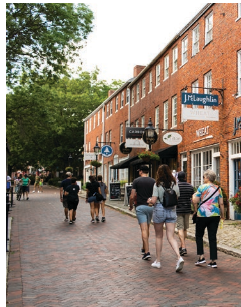
from left to right: Schooner Fame, Salem (© NBCVB); Lobsters (Courtesy of Mile Marker One, Gloucester); Downtown Newburyport (© NBCVB) cover photo: Marblehead Harbor (© Derrick Mills)