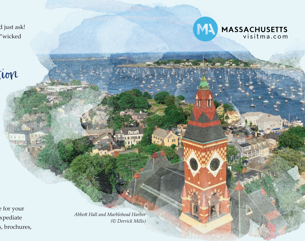
Abbott Hall and Marblehead Harbor

NORTH of BOSTON Convention & Visitors Bureau